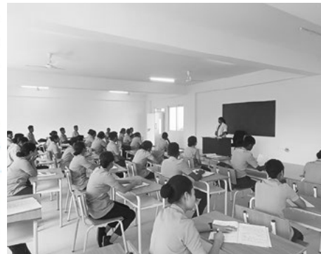
Well Trained & Experienced Faculty