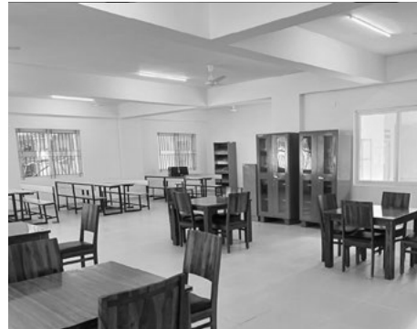
Inspiring Knowledge-Bound Library