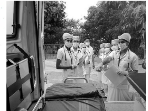
Clinical Training at Various renowned Hospitals at Bengaluru