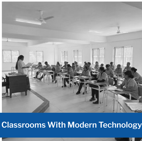
Classrooms With Modern Technology