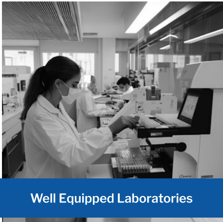
Well Equipped Laboratories