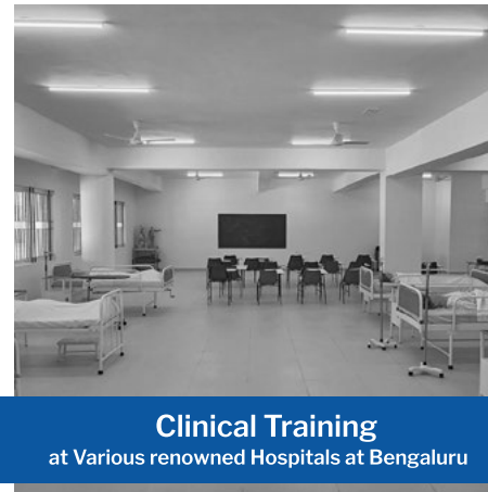
Clinical Training at Various renowned Hospitals at Bengaluru