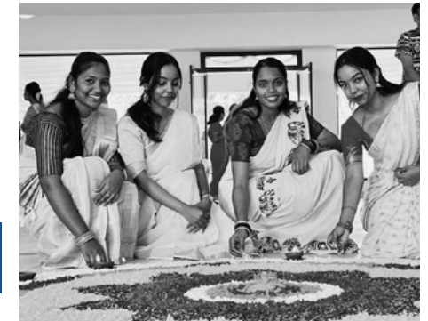
Dynamic Co-curricular Activities